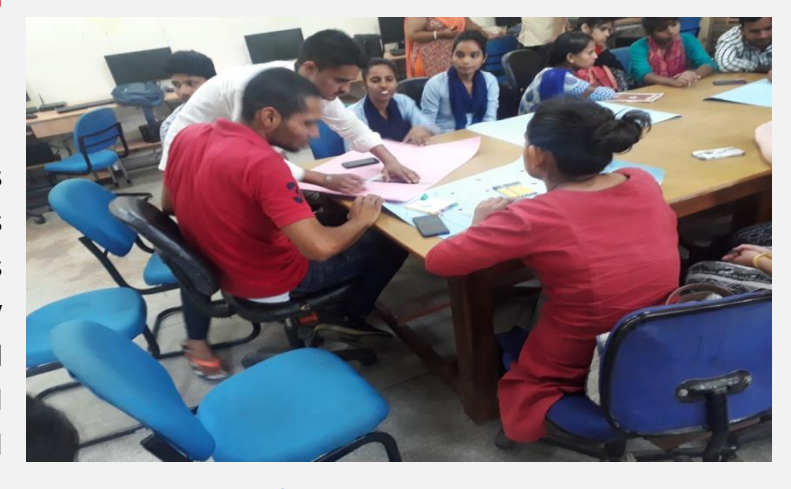
Figure 1: Students of Govt ITI Panipat Drawing their PSA Maps

These PSAs were conducted by 20 students from Govt. ITI Panipat and five youth leaders of MFF from Samalkha, Panipat. The students and youth leaders were accompanied by seven facilitators from MFF, who supported the youth in conducted the PSAs and consolidating their findings and recommendations.