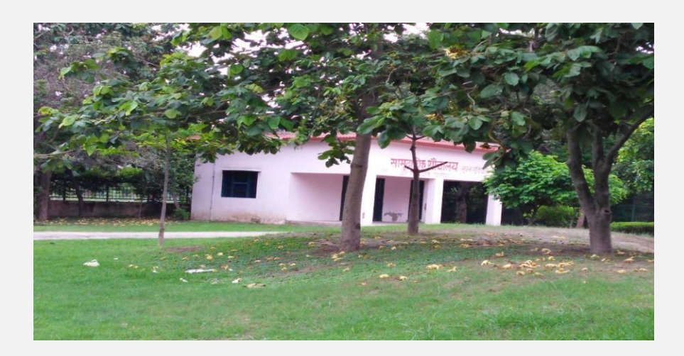
Figure 2: Closed Toilets at Tau Devi Lal Park

• Spaces like parks, gardens, chowks and chaupals are not just public spaces for recreation, but also spaces for political and social mobilization and discussion. However, these spaces are often dominated by men, with limited or no access for women and girls. This limited access is a huge deterrence towards women and girl's integration into political and social lives. They remain unaware of public debates and